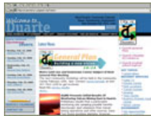
City of Duarte